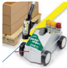
Side striper: To mark pallet edges, walls, etc.