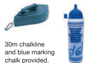
30m chalkline and blue marking chalk provided.