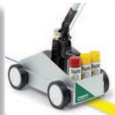
Aerosol holder: For a quick replacement.